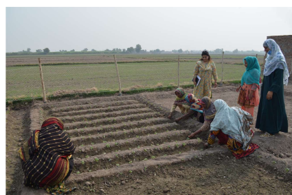
Pg. 1, Left: A woman farmer in Khyber Pakhtunkhwa.